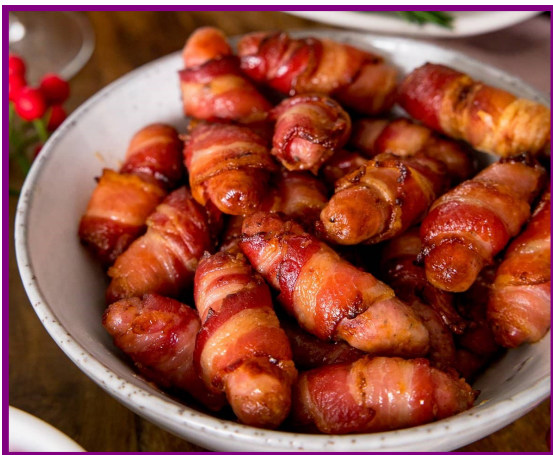
These are Pigs in Blankets, which are some of Finlay Flyer's favourites.

Some families in France traditionally eat goose, venison and a selection of cheeses on Christmas Day. They would follow this with "Buche de Noel," which is similar to a Yule Log.